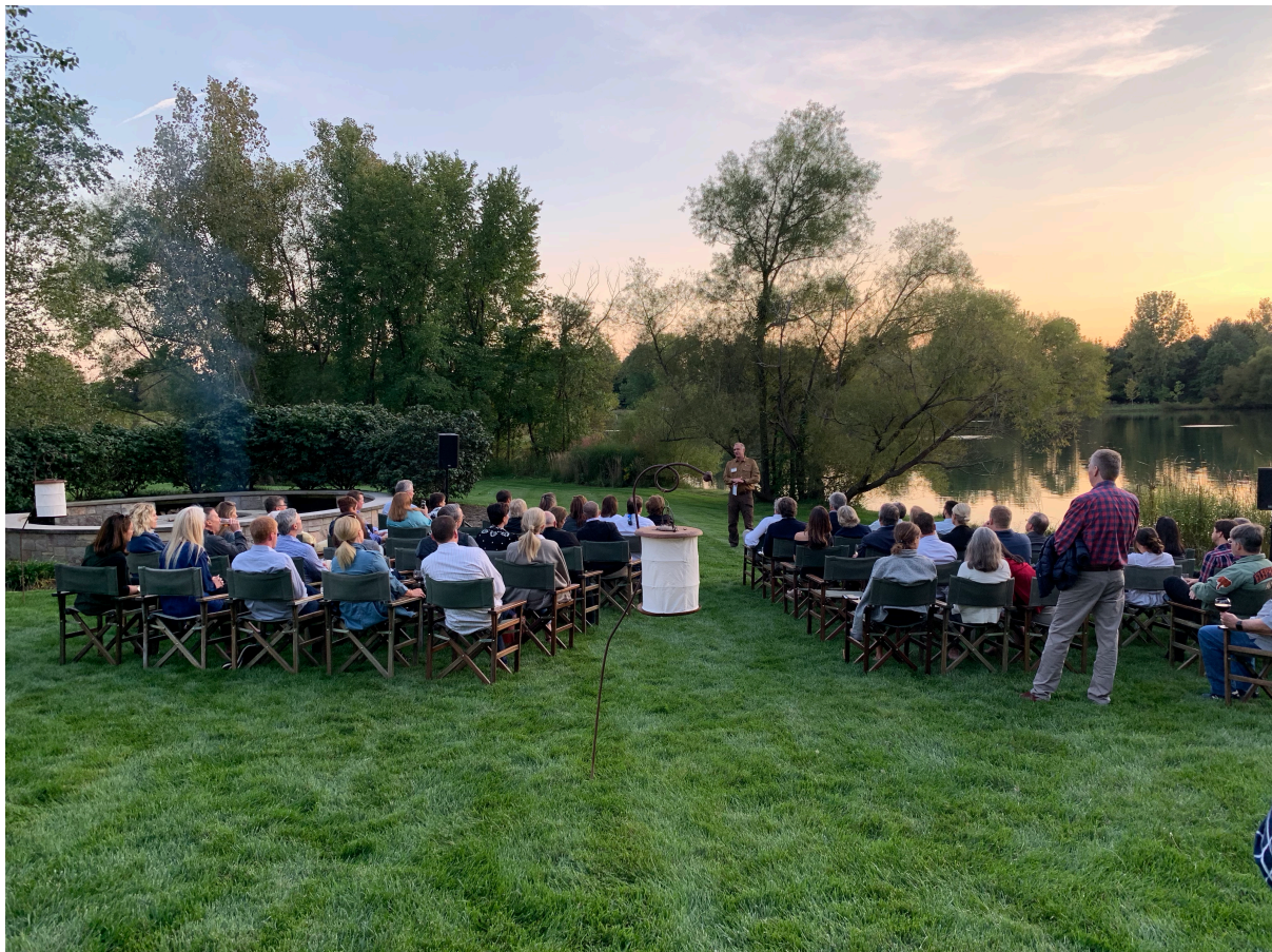
Presenting at the MEP supporter event in Indianapolis, IN.