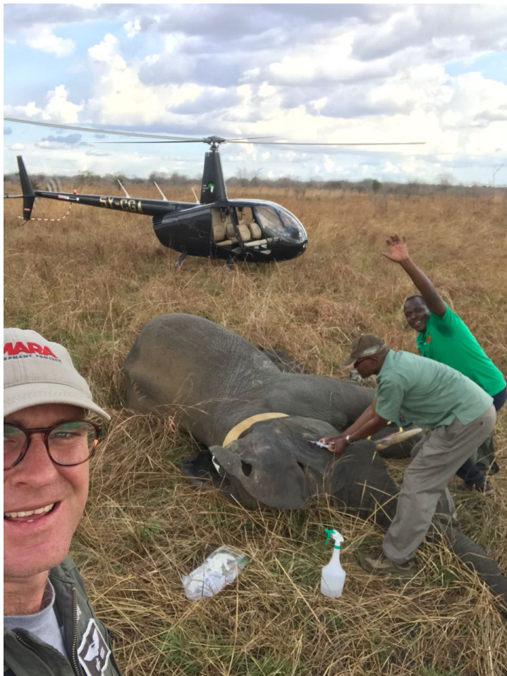
This was the first elephant collaring operation in Tanzania on September 5.

A highlight for this month was the work MEP did with Tanzania Wildlife Research Institute (TAWIRI) in the Selous Game Reserve in Tanzania. We collared a total of 13 elephants between September 4 and 11 to start to understand how elephants move inside this huge ecosystem. In addition to this main goal, it was also a great cross boundary team building exercise. I was impressed by the expertise of the TAWIRI team and it was a pleasure to work with them.