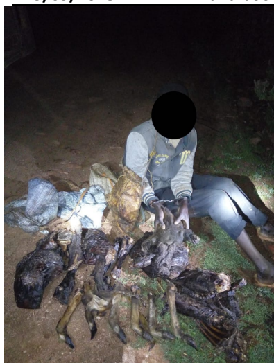
One suspect arrested on September 29 with 15 kg of bushmeat.