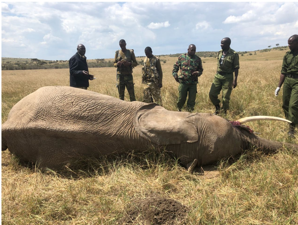
One of the two elephant carcasses reported on September 4 and 5.

The increase in elephant mortalities is concerning this month. The conflict related causes of death especially in the Mara North Conservancy area means that there is a new cell attacking elephants in the area. Usually we see more conflict related deaths during the crop ripening seasons, but this increased number of deaths corresponds with the drying up of the area. This leaves us to believe that the conflict that elephants are now coming into is a result of their access to limited water and grass resources and the competition with herders for it. The elephant deaths attributed specifically to spearing is most likely this type of conflict especially since there are crops still in the fields in the area.