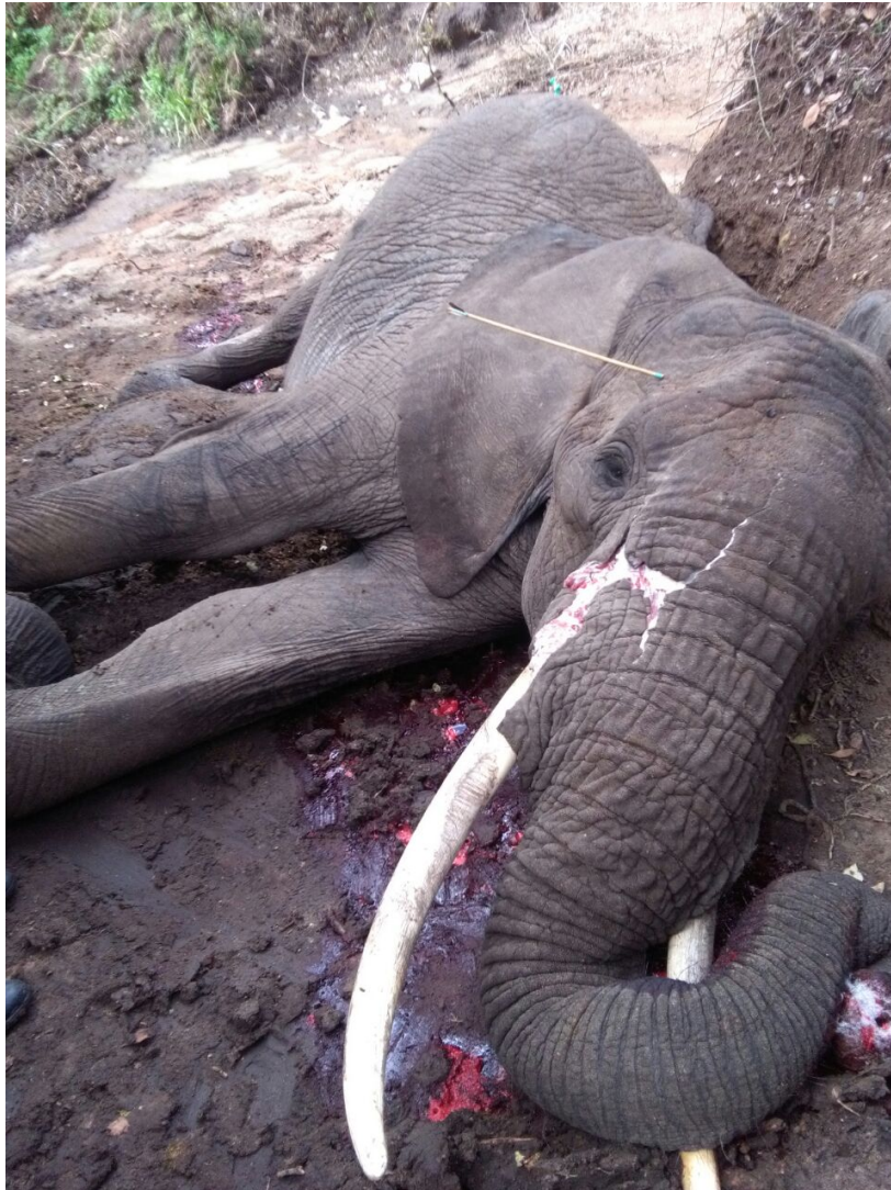
Bull elephant killed in the Inkenye area on the 29 th of December.