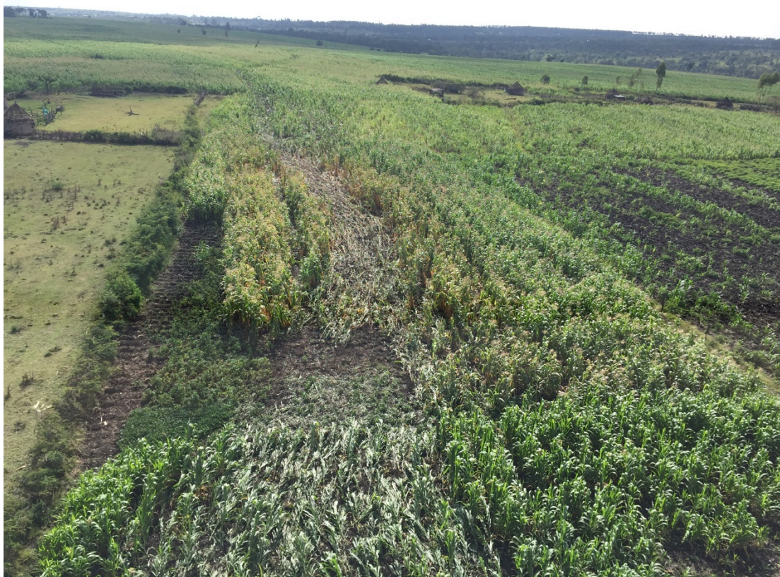
Crop damage caused by elephants in the Inkenye area Transmara.