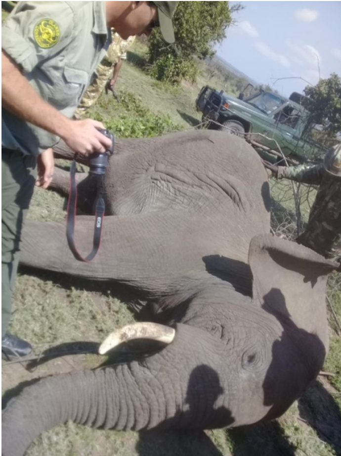
The carcass found with a spear wound on August 31.

Dead elephant on: 31/08/2018. Carcass was found in the border of Olkinyei Conservancy and former Olkinyei Group Ranch; the carcass was reported by local community to KWS rangers and to MEP. Raw cause of death is spear wound, cause of death considered as human-elephant conflict. Mike file number 31/18.