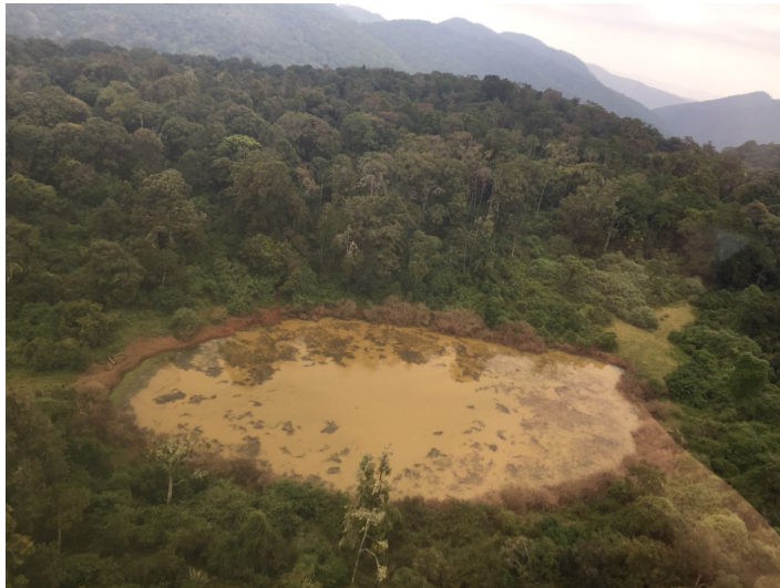
The pond where Amare's collar location was reading.

one of the forest clearings. After searching the 5 -foot-deep pond we still have not located the collar. We suspect it fell off when she was inside the pond, but we are not ruling out poaching or a malfunctioning collar. We will continue looking and get to the bottom of this issue.