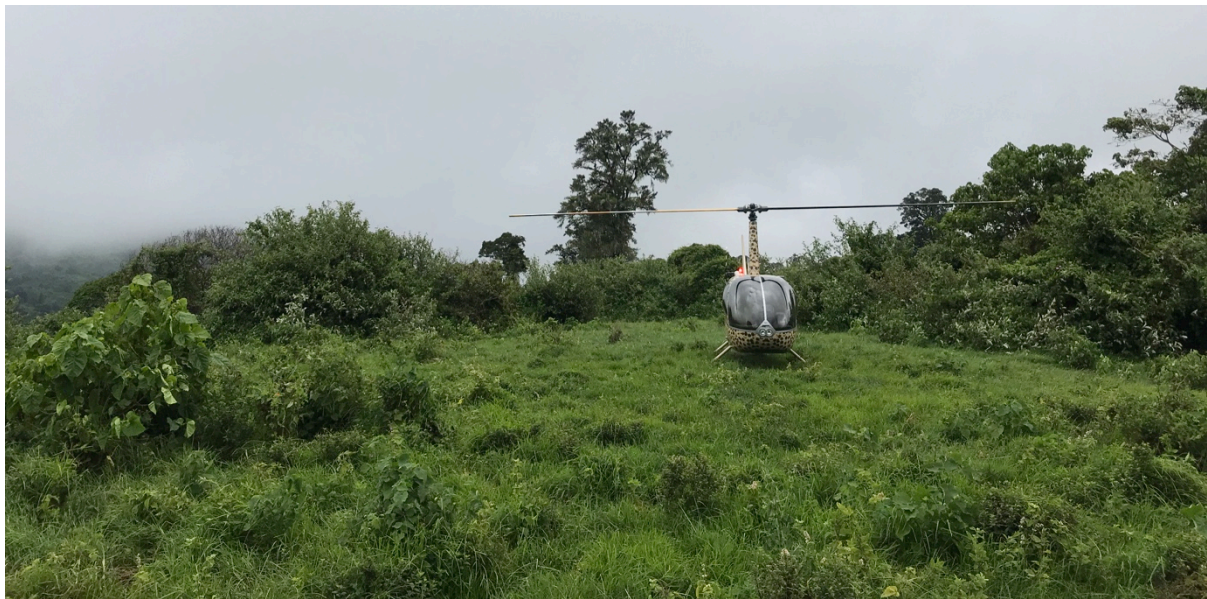
Landing pad in a small clearing in Loita waiting for the weather to clear.

Yet again, the Robinson R44 continues to impress. This month it was deployed to collar in the Loita Forest. We visited villages for local intelligence around the forest, ferried in ground teams to the collaring site, darted a female and followed her until she went to sleep, and then perched in a tiny clearing while we dropped single team members off at the collaring site. I was extremely impressed by the performance at high altitude and maneuverability in the forest.