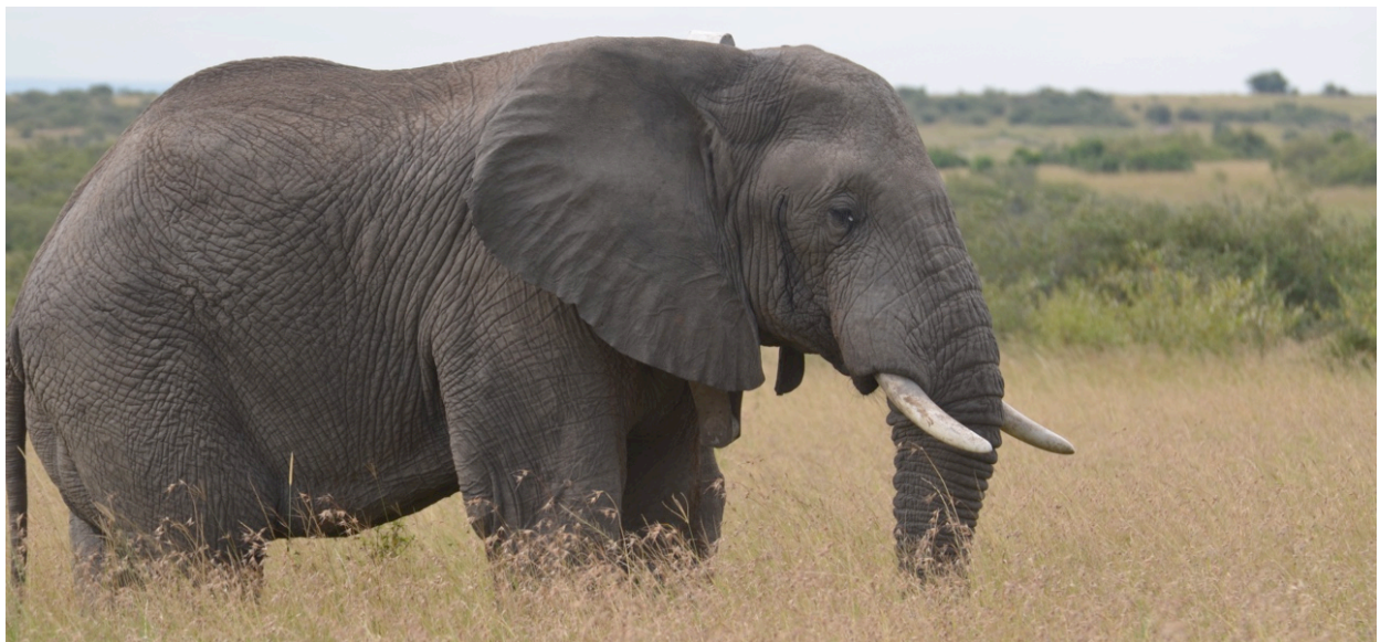
Collared elephant Matoba in Kenya.