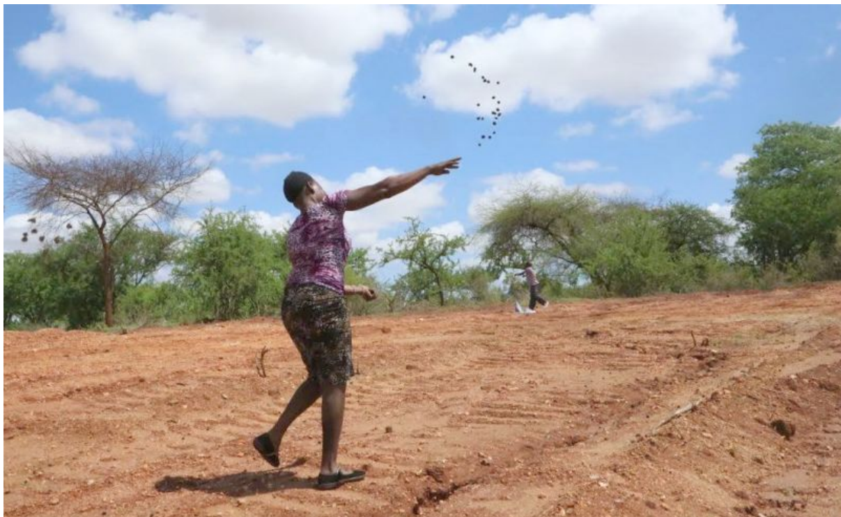
Seedballs from Seedballs Kenya being distributed.