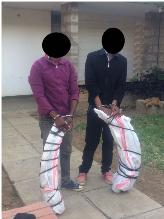
Suspects arrested between Ewaso Ngiro and Lulunga near Narok Town.