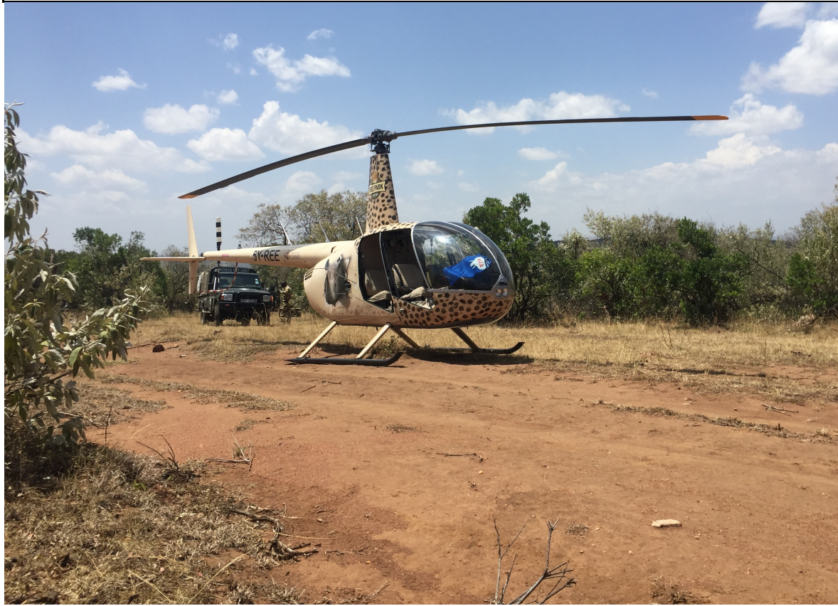
Looking for wounded elephants in the Morijoi area.