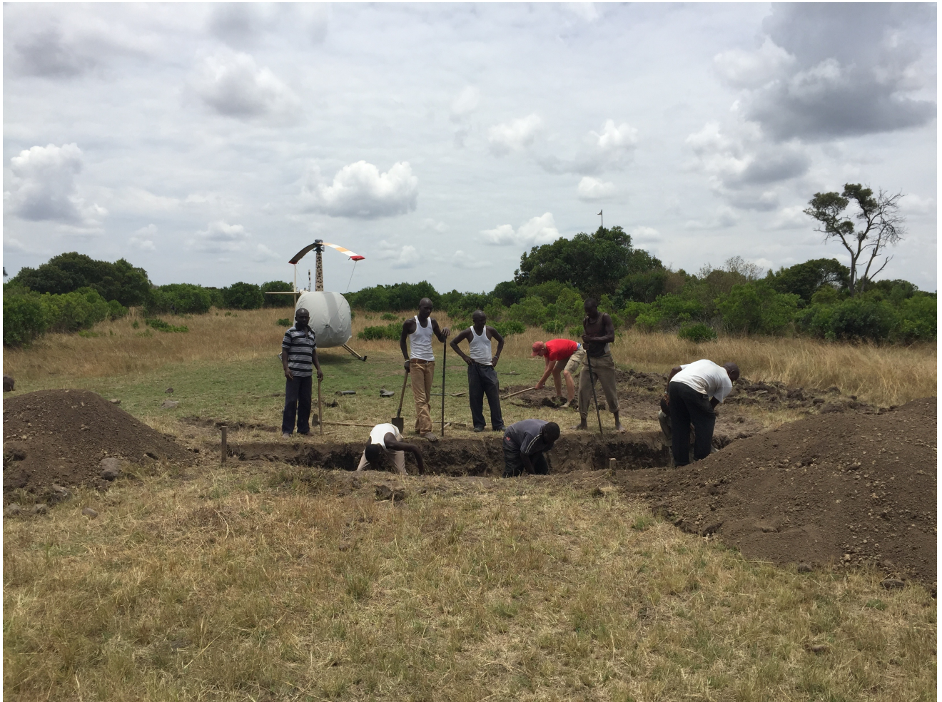
Foundation for the hanger being dug

Develop funding partnerships: DSWT have responded that they can use us for the sky vet program