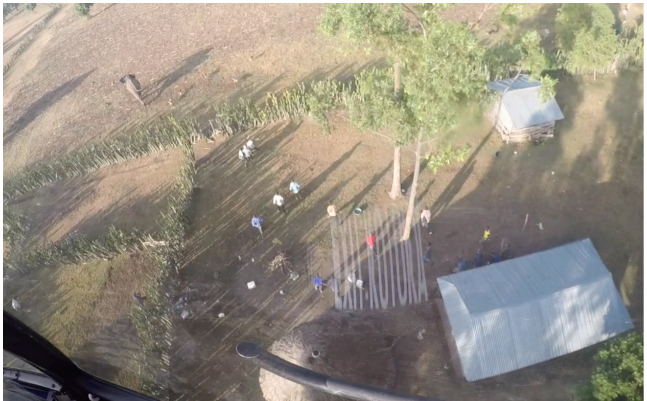
Community chase an elephant in the Munyas area. The helicopter was invaluable at keeping the elephants moving to safety.